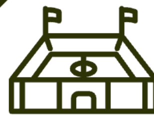
HOPSON FIELD HOUSE