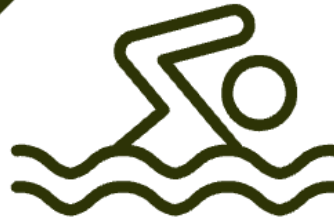
DON COOK NATATORIUM