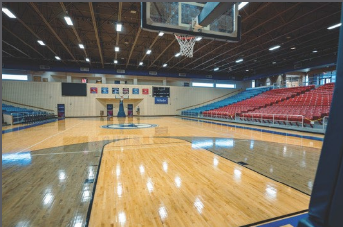
WHEELER FIELD HOUSE