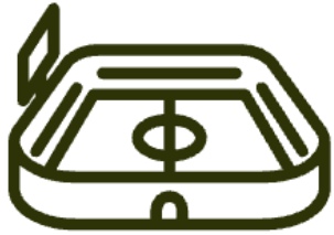
WHEELER FIELD HOUSE